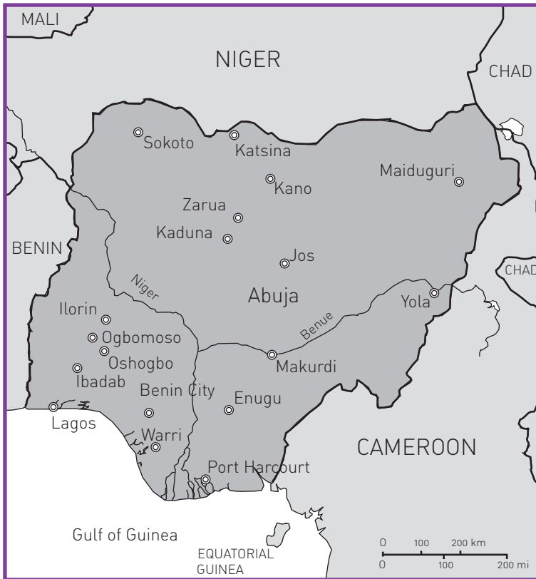
Map of Nigeria